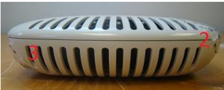
Figure 10: AP-135 Right view