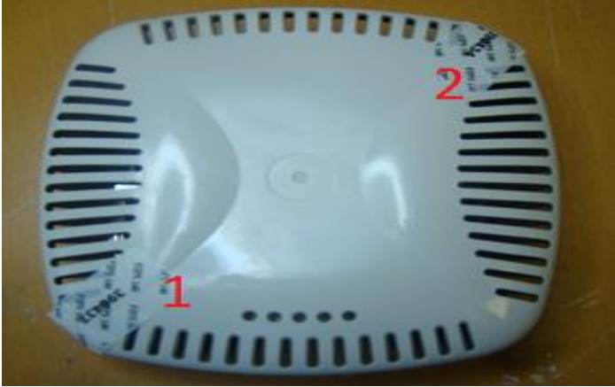
Figure 11: AP-135 Top view