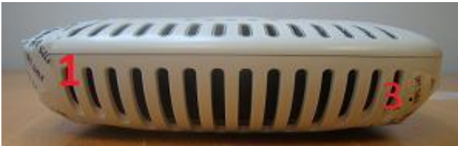
Figure 1: AP-134 Front view

Following is the TEL placement for the AP-134: