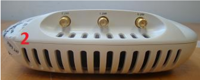
Figure 2: AP-134 Back View