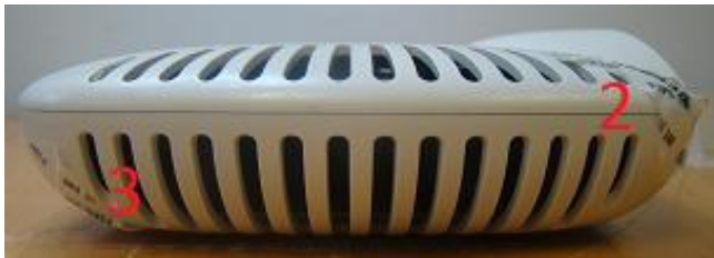
Figure 5: AP-134 Right View