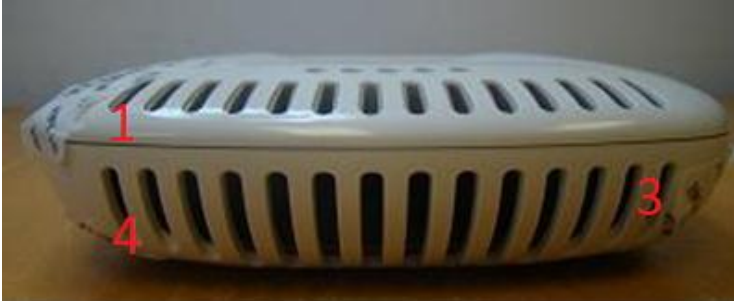
Figure 7: AP-135 Front view

Following is the TEL placement for the AP-135: