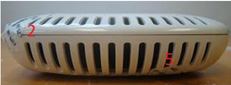
Figure 8: AP-135 Back view