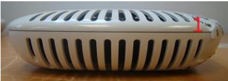
Figure 9: AP-135 Left view