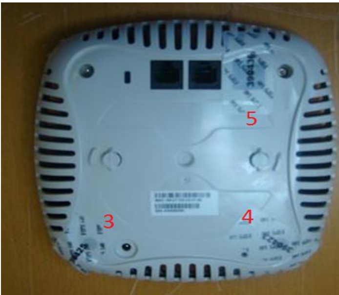
Figure 12: AP-135 Bottom View