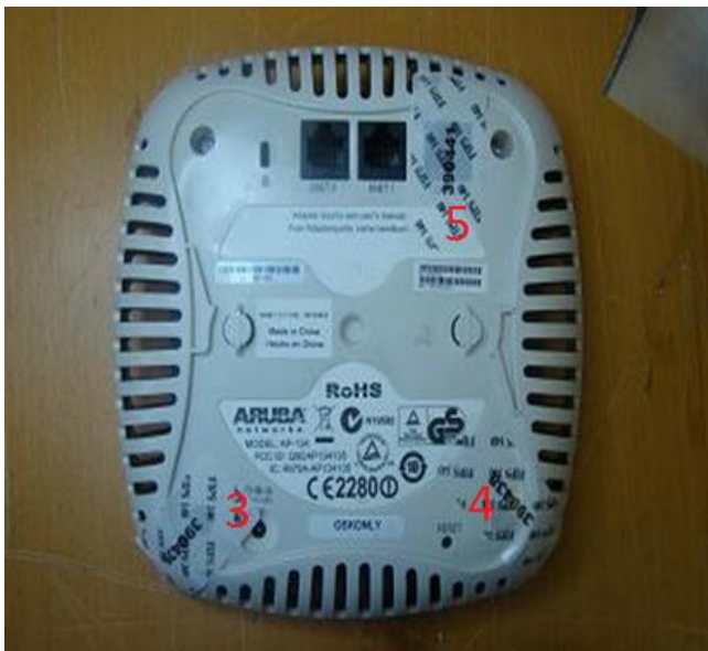
Figure 6: AP-134 Bottom View