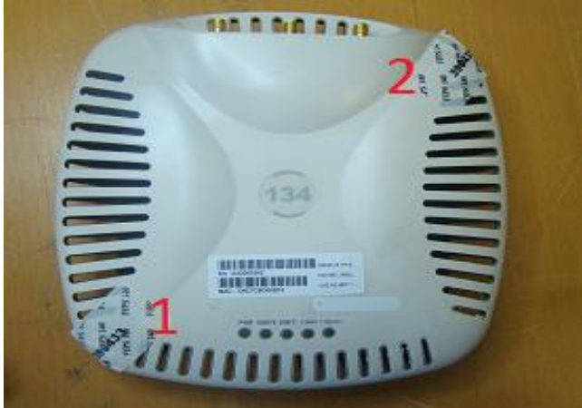
Figure 4: AP-134 Top View